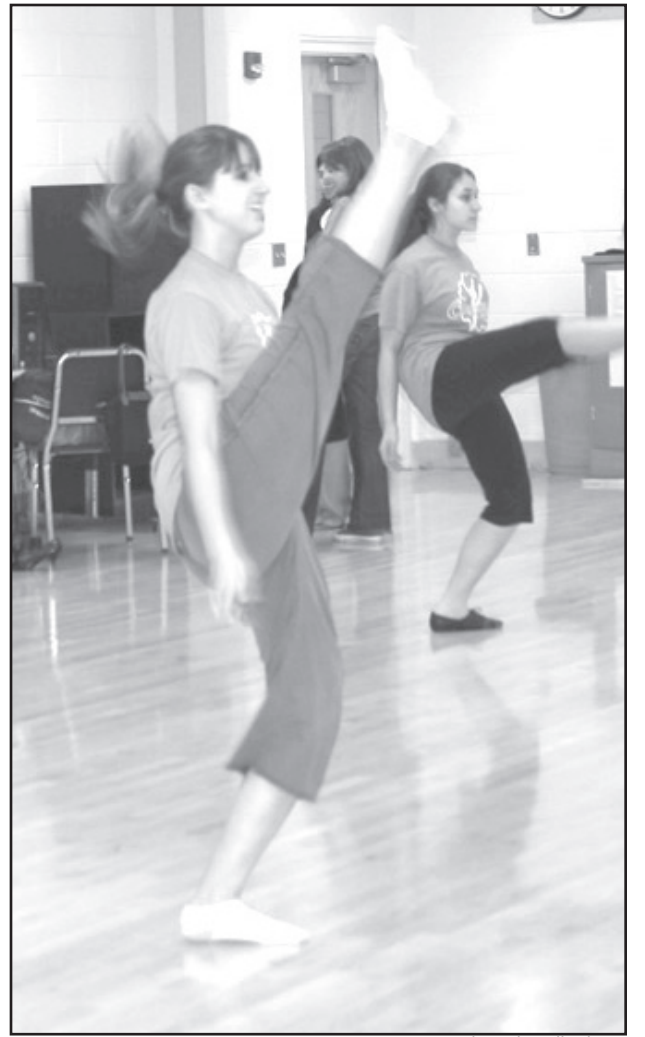
Logue